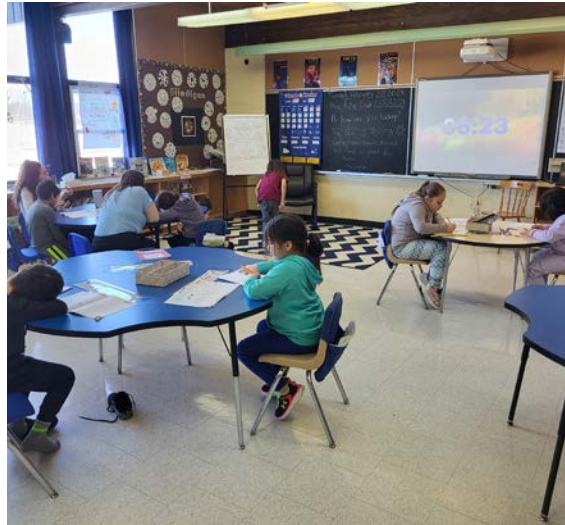
Peek into the classroom!